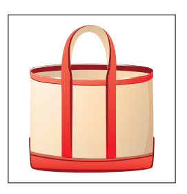
Over-sized Tote Bag