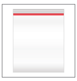
1-Gallon Plastic Freezer Bag