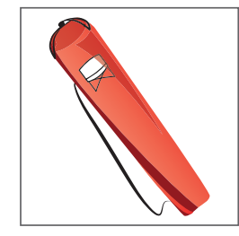
Folding Chair Bag (Folding Chair is Allowed)