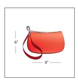
Bags smaller than 6"x 6"x 6"