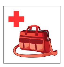
Medically Necessary and Diaper Bags*